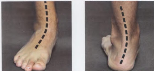
Partial Talotarsal Dislocation